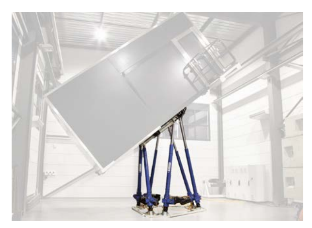
DCNS uses SIROCCO hexapods as submarine simulators for training purposes to reproduce the emergency situations that submarine crews might encounter during a mission.