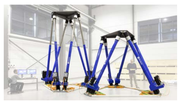
FMC Technologies uses two SIROCCO XL hexapods to test a ¼ scale LNG loading arm. These hexapods simulate the swell motion to qualify the loading arm that will connect a gas carrier to an offshore gas production factory. One hexapod simulates the gas carrier, the other the offshore factory.